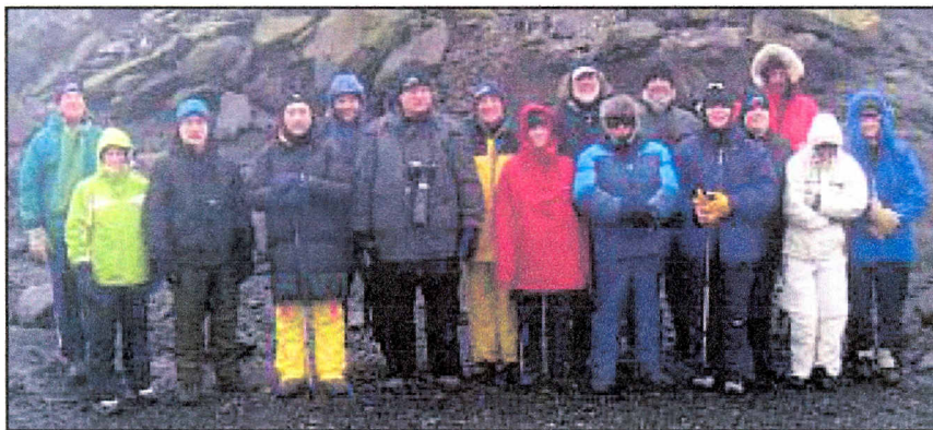
The SSC in Antarctica

The SSC members were also fortunate enough to travel to King George Island, Antarctica for two days where they were guests at the Chilean Eduardo Frei Montalva Air Base. The SSC also visited the Great Wall Base of the People's